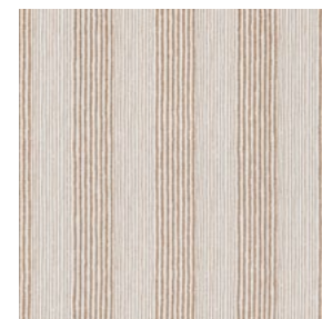
Union Ticking TICK013