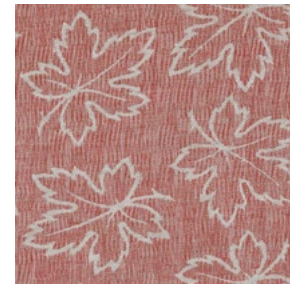
Linen Maple MAPL004