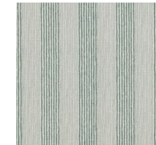
Union Ticking TICK008