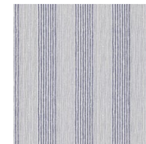
Union Ticking TICK011