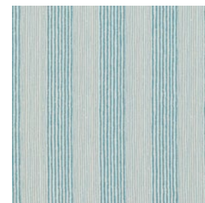
Union Ticking TICK009