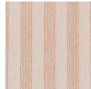
Union Ticking TICK005