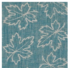
Linen Maple MAPL009