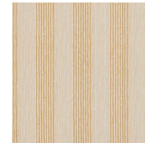
Union Ticking TICK006