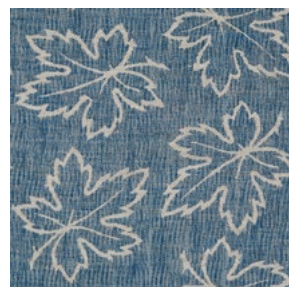
Linen Maple MAPL010