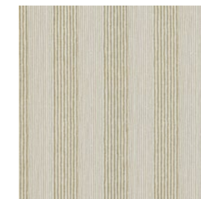
Union Ticking TICK015