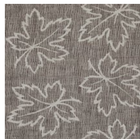
Linen Maple MAPL014