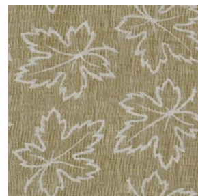
Linen Maple MAPL015