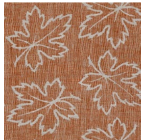
Linen Maple MAPL005