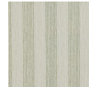
Union Ticking TICK007