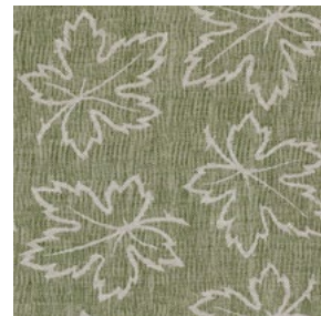
Linen Maple MAPL007