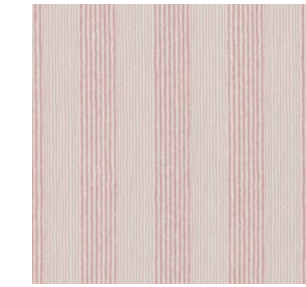
Union Ticking TICK004