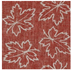
Linen Maple MAPL001