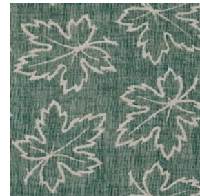
Linen Maple MAPL008