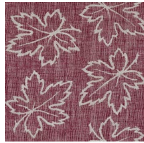
Linen Maple MAPL002