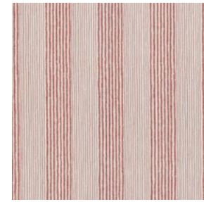
Union Ticking TICK001