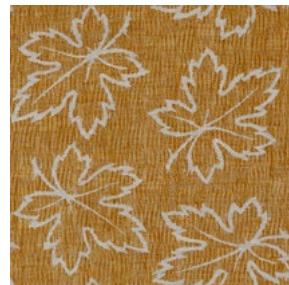
Linen Maple MAPL006