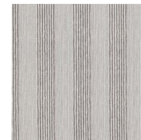
Union Ticking TICK014