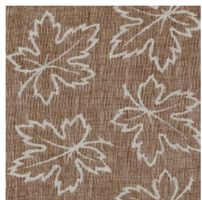
Linen Maple MAPL013