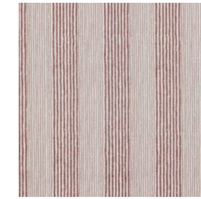
Union Ticking TICK003