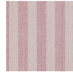
Union Ticking TICK002