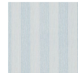
Union Ticking TICK012