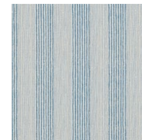
Union Ticking TICK010