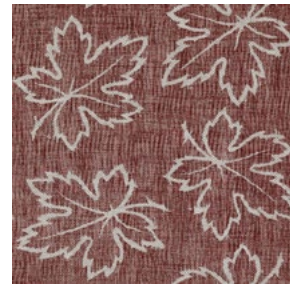
Linen Maple MAPL003