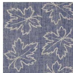
Linen Maple MAPL011